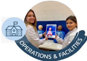
OPERATIONS & FACILITIES

School District 60 will provide facilities and maintain a safe and supportive learning environment, appropriately equipped to facilitate quality teaching and learning.