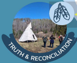
TRUTH & RECONCILIATION

School District 60 recognizes that we operate on the traditional territory of the Dane-zaa within Treaty 8, and will focus on building strong connections with local Indigenous communities and integrating Indigenous knowledge and culture into learning and the school community. All Indigenous students need to feel that they are valued and respected.