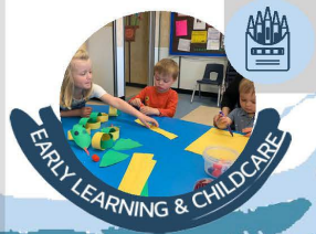
EARLY LEARNING & CHILDCARE

School District 60 recognizes that we operate on the traditional territory of the Dane-zaa within Treaty 8, and will focus on building strong connections with local Indigenous communities and integrating Indigenous knowledge and culture into learning and the school community. All Indigenous students need to feel that they are valued and respected.