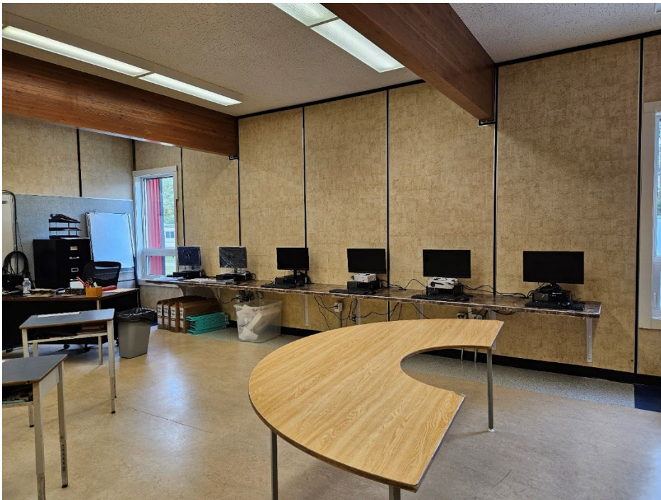
Buick Creek School Computer Classroom